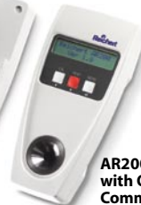
AR200/TS METER-D with Optional Communications Cradle