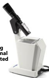
Goldberg w/Optional Illuminated Stand