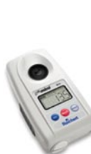
r 2 mini